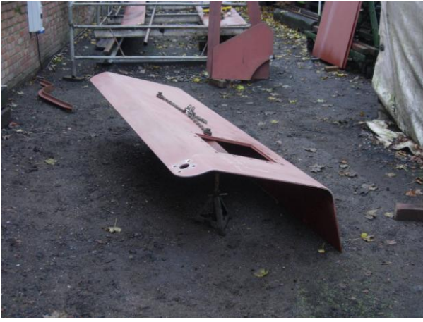
The upper coal plate, showing the access hatch with reinforcing plate underneath. The holes drilled in the corner are for the breather pipe