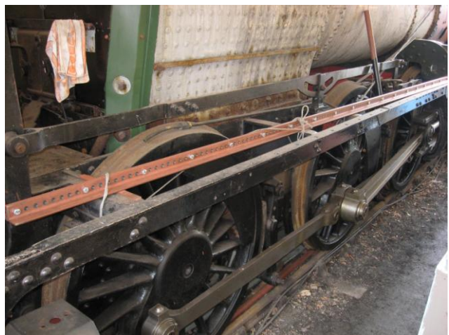
The bunker nears completion as work on the tanks begin - June 2012 - Tony Summerton