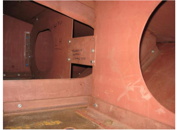
The now-hidden water space

One thing we'll have to be very careful about is specifying the exact order in which the final riveting and welding are done, so that at all times you're not doing anything which restricts or prevents access to the next part of the job. Flowcharts definitely have their place!