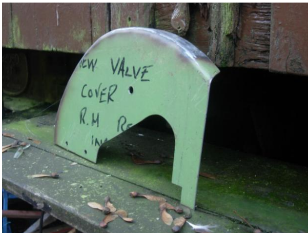
A new section of cladding for the valve chest. The upper edge has had to be cut, bent, welded and ground to produce the end result

Having said that, extreme care will have to be taken to ensure that the tanks line up precisely with the bunker and the cab roof, and sit absolutely flat on their supporting framework. The whole structure is interconnected and there's no scope for alignment error, either laterally or longitudinally. A lot of careful measurement will be required, and we're contemplating fabricating a 'virtual' cab roof made up of either wood or metal strip, with holes drilled to match those in the cab roof itself but having a fraction of the weight of the real thing. The outer angles at the base of the tanks will certainly need to be drilled on the loco, to ensure that the bolting down holes are in alignment with those in the supporting angle. The tanks are supported on a number of hefty steel brackets riveted to the main frames, and heavy L-shaped angles are riveted to the outer edges of these brackets. It is to these angles that the tanks are bolted down, there being no permanent attachment at all to the loco's main frames below the inner faces of the tanks. What then, you might ask, stops the tanks from falling off the loco sideways when subjected to lateral