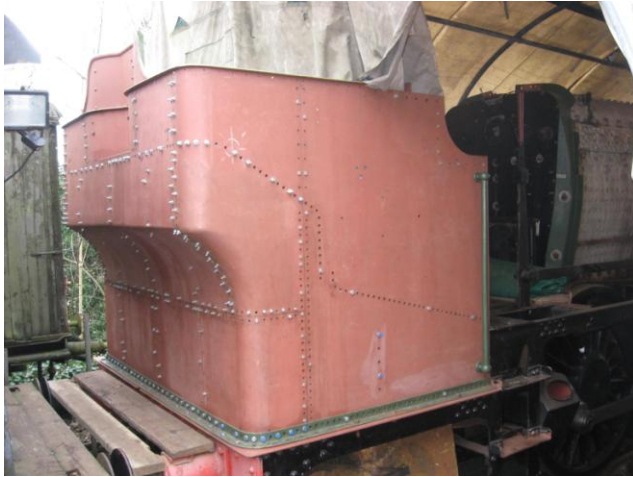
The structurally-complete bunker on 6 Jan 2013, shortly after the bunker side was re-installed

The tanks, then, are the next major item on the agenda, and we hope to complete them more quickly than the bunker, which was delayed somewhat by the change of tack en route when we were advised not to re-use a